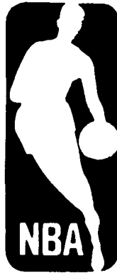
Fig. 3. NBA Logo

As an example in the sports context, the NBA has successfully registered and asserted trademark rights in its logo of a basketball player dribbling a basketball 78 (Figure 3). Similarly, the Kareem Abdul-Jabbar "sky hook" is also captured in two pending trademark applications. 79 While the NBA logo and the "sky hook" design mark comprise sports moves frozen in a stylized silhouette, trademark rights might also extend to protect a three-dimensional, real-time movement of a sports figure. Given certain technological changes and the realities of the marketplace, this type of protection should easily be palpable. Trademark law and its underlying theories of unfair competition are already prepared to embrace such protection. As with many other aspects of the marketplace, the first people prepared for this change will benefit by their early action.