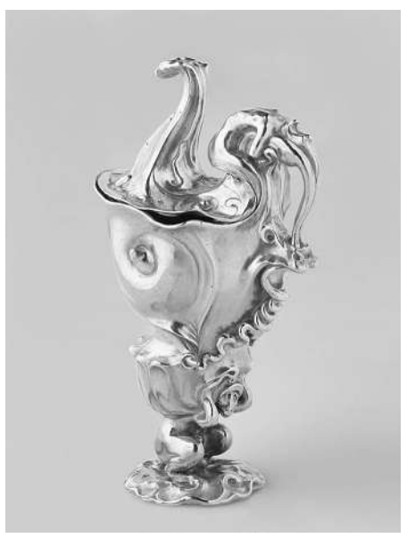
Adam Van Vianen, Memorial Guild Cup (1614)<sup>7</sup>

Museum of Art provides open access to its collection using the Creative Commons CC0 public domain tool.<sup>5</sup> Rijksmuseum also provides open access to its collection using the CC0 tool but encourages attribution to the author of the artwork and a credit to the museum.6