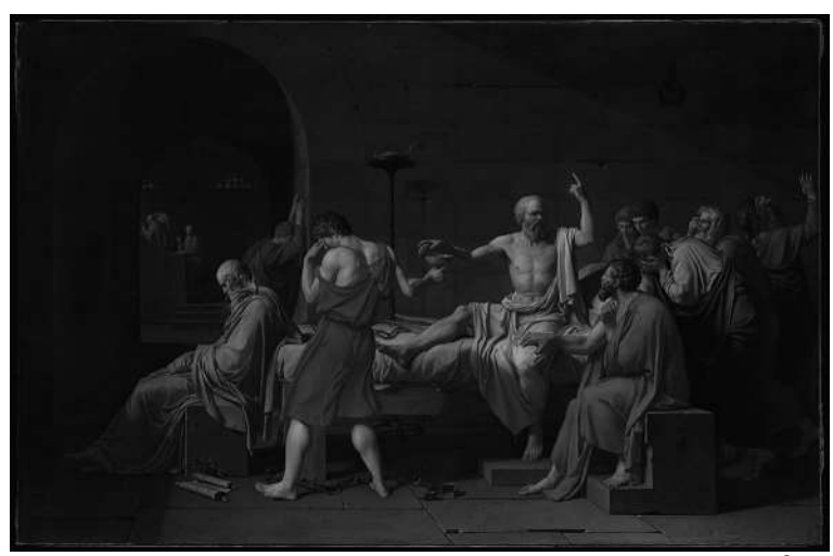
Jacques-Louis David, The Death of Socrates (1787)<sup>8</sup>

But many museums have more restrictive policies. For example, the British Museum has adopted a "Creative Commons Attribution-NonCommercial-ShareAlike International (CC BY-NC-SA 4.0) licence" and only requires researchers to pay licensing fees for commercial uses of images of artworks in its collection. However, it has adopted a very broad definition of commercial. Specifically, the British Museum considers a publication "commercial" unless it is available to the public for free. 10 For better or worse, most art history scholarship is published in academic journals and books that are sold. According to the British Museum, those are commercial publications, so the authors have to pay a licensing fee, even though the circulation of the academic journals and books is usually quite limited. Other museums flatly