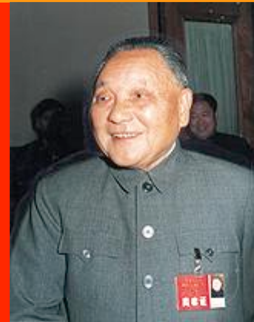
Deng Xiaoping 1904-1997