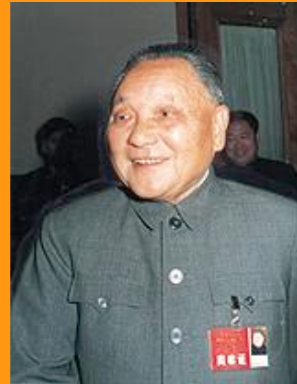
Deng Xiaoping 1904-1997

A: "Well, It's governed by the Communist Party..."