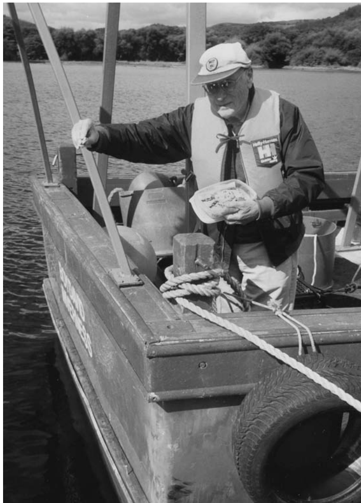
Aboard the fishing vessel Boy David in August 2003, Rines displays a recovered bottom glacial clay sample from Loch Ness. His 2001 and 2002 expeditions recovered similar samples, and ancient marine shells and organisms, confirming the sea (pre- and post-glacial) incursions into Loch Ness.

In 1963, he founded the Academy of Applied Science, a Massachusetts and New Hampshire-based, private, nonprofit organization dedicated to the promotion of science and technology education and the encouragement of invention. He later founded Franklin Pierce Law Center in 1973 to help save the patent system in the United States and more generally to modernize legal education in a technological era. In 1994, Rines was inducted into the National Inventors Hall of Fame and became the first inductee into the U.S. Army Signal Corps