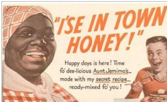
Figure 2: AUNT JEMIMA ad, circa 1940s, which exemplifies the pervasive stereotypes of the day 231