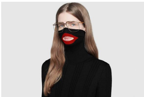
Figure 3: Gucci balaclava sweater withdrawn from the market after social media protests 232