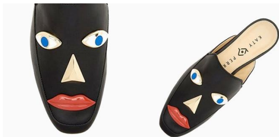
Figure 4: Katy Perry “RUE” slip-on loafer, removed from the market one week after the Gucci sweater 233